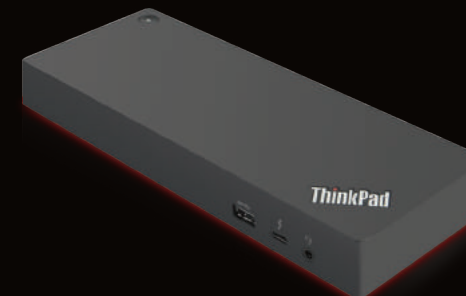
ThinkPad ® Thunderbolt ™ Workstation Dock