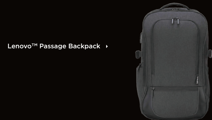
Lenovo ™ Passage Backpack